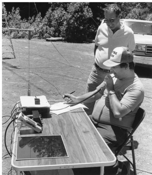
Solar powered station

during their shifts. A log book per band available to either station operator, will dictate who will be on which band at a given time. Operating will be in half hour increments on a sign up sheet to give everyone an opportunity to participate. logging and duping will be on forms provided.